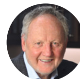
Michael Fullan Global Leadership Director