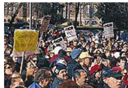
Striking workers in Toronto last month